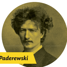
Ignacy Jan Paderewski